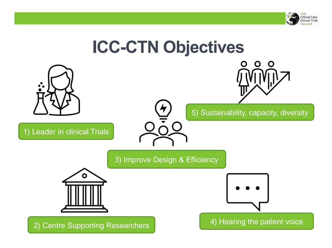
Figure 1. ICC-CTN Strategic Objectives

A major strategic objective of the Irish Critical Care Clinical Trials Network is to be a centre supporting researchers (See Figure 1.). As part of our 2021-2026 phase, our programme includes a dedicated work package focused on developing Clinical Trials and Trialists of the Future. We have allocated funding to support this initiative in the form of annual seed funding awards for early career researchers – the ICC-CTN Early Career Researcher Seed Funding Awards. This will help to develop a pipeline of future trials and trialists in critical care research.